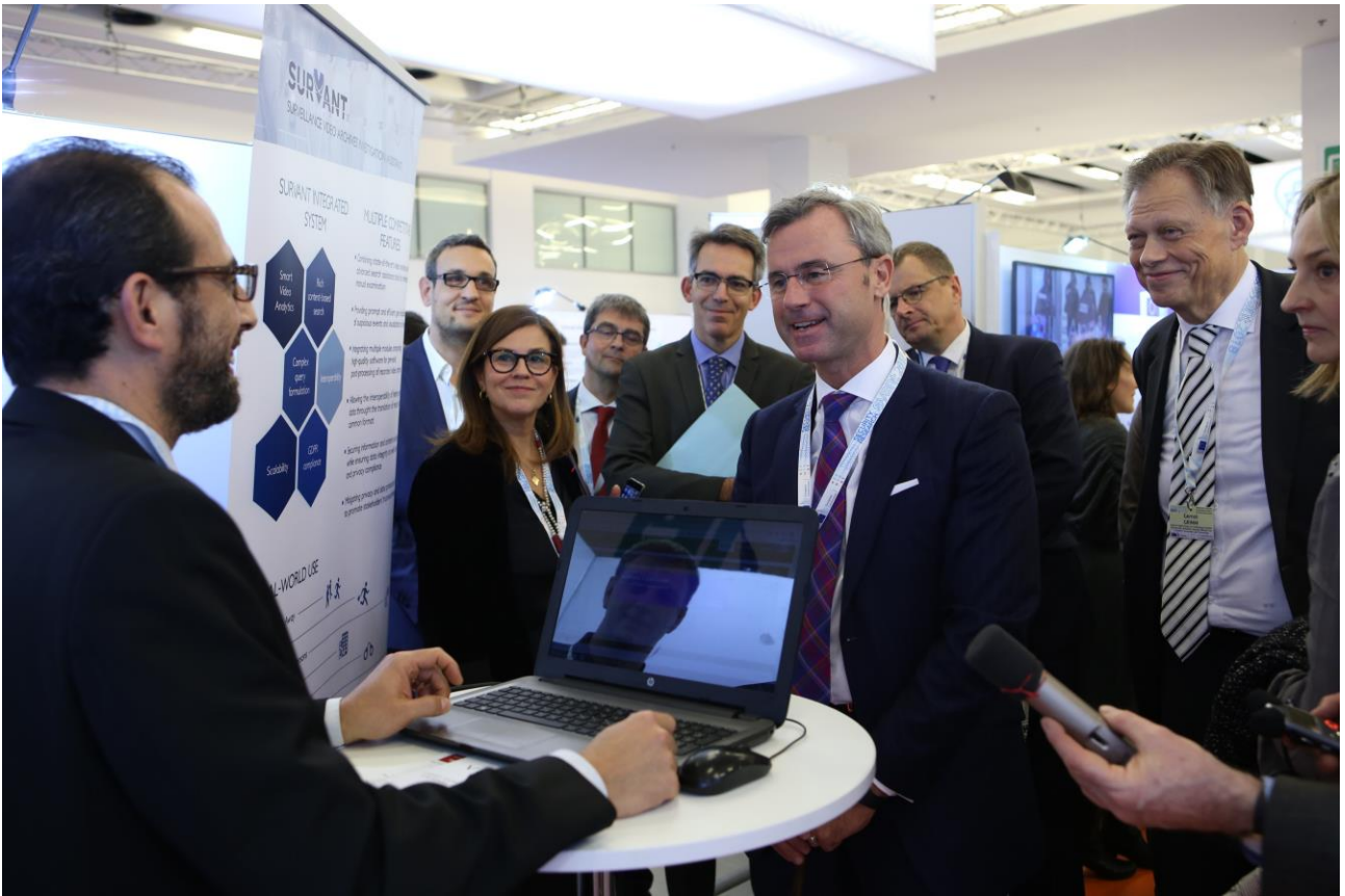
Many stakeholders interested in the project were glad to join the SURVANT booth where they found the related dissemination materials such as brochures, newsletters and technical factsheets.